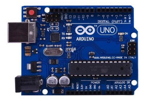
Figure 5.3: Arduino Uno

The Arduino Uno is a microcontroller board based on the ATmega328 (datasheet), UNO is the version of Arduino. It contains everything what needed to support the microcontroller, simply connect it to a computer with a USB cable or power it with a AC-to-DC adapter or battery to get started. The Uno differs from all preceding boards in that it doesn't use the FTDI USB-to-serial driver chip. Instead of, it features the Atmega8U2 programmed as a USB-to-serial converter.Uno means one in Italian and another is named to mark the upcoming release of Arduino 1.0. The Uno & version 1.0 will be the reference versions of Arduino, moving forward. The Uno is the latest series of USB Arduino boards, and the reference model for the Arduino platform; for a comparison with previous versions, see the index of Arduino boards.