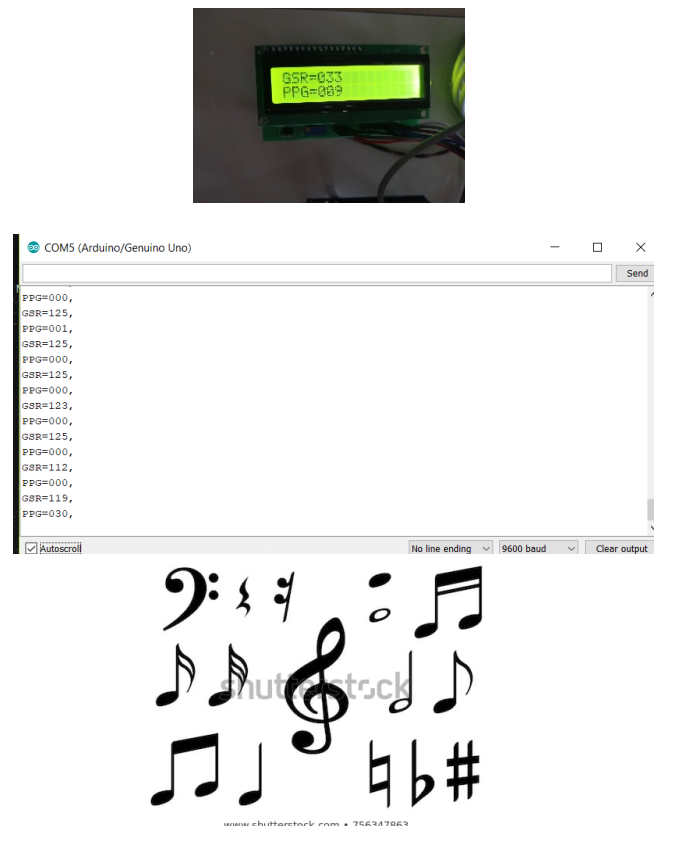
Fig 6.1: Final outcome of the Emotion Based Music Recommendation System

Fig 6.1 shows the result of the emotion-based music recommendation system. When the fingers of the user are placed over the GSR and PPG Sensor, the values of the heart beat and emotion of the user is recognized, the values are displayed in the LCD display. Then based on the values, music will be played for the user.