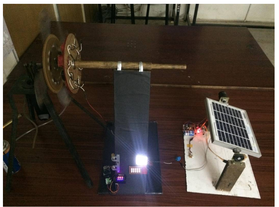
Fig. 3. Complete setup

(A High Impact Factor, Monthly, Peer Reviewed Journal) Website: <u>www.ijircce.com</u> Vol. 6, Issue 7, July 2018