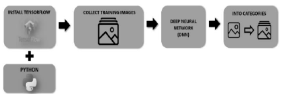
Fig 1: The block diagram of Image Classification

Given Figure 1, it is the system of image classification where deep neural networks are additionally applied. There are four (4) stages all through this cycle, and every one of the stages will be talked about. Every one of the stages is remembered for TensorFlow as the open-source programming and Python as its programming language[5]. At that point, the cycle is kept on gathering a portion of the images (contributions), by applying DNN and ultimately, all images will be arranged into their gatherings.