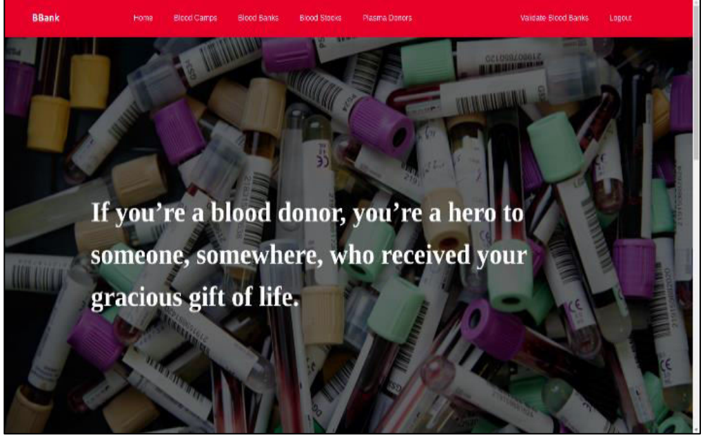
Fig. 1 Homepage