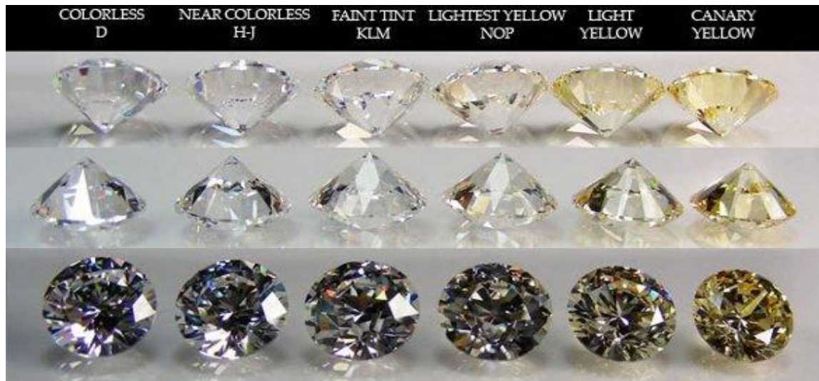
Fig 1– Diamond color grading