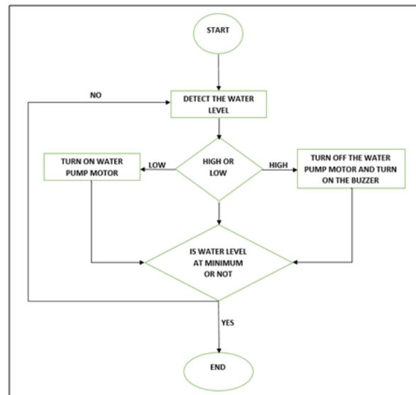
Fig.2.1: Flowchart of water level detection system