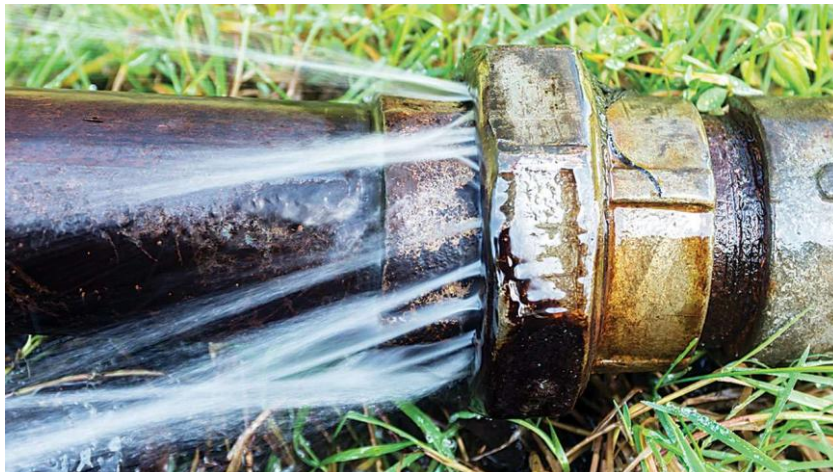
Fig.2.2: Leakage in pipes