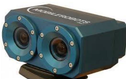
Fig. 5 Computer vision devices

It is an artificial system that takes information from images. The image data can be in many forms, such as video sequences, multiple cameras, or a medical scanner. System is basically fitted with one or more cameras used as sensors to provide a secondary feedback signal to the system controller to more precisely move to a different target position. The vision system finds the position which shows the exact location coordinates of the components to the system which are spread out randomly beneath the camera's view. Figure 5 shows an image of a computer vision device.