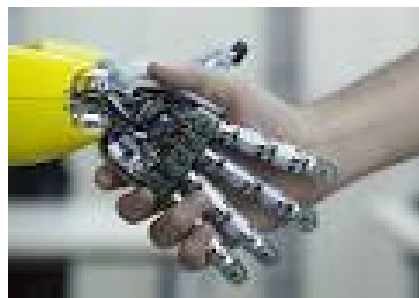
Fig: 2 Human hand touching a Robot

This technology creates the sense of touch by applying forces, vibrations or motions. Haptic devices may integrate tactile sensors that evaluate forces exerted on the interface. The sense of touch is of two types, such as: passive and active. By and large Haptic is frequently associated with active touch for communicating or to recognize objects. Initial battery energy (IBE) is 50Jules for each node. This technology has proved that the sense of touch in human is working well with the control of Haptic Virtual object [6]. Figure 2 shows a human hand in touch with the robot.