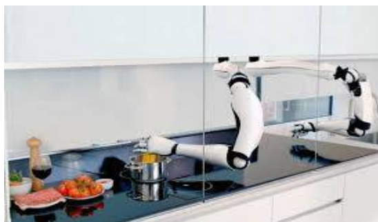
Fig .6 Gustatory system

Gustatory refers to taste and its displays are discussed in the literature, and it is found that no system has fully emerged that can be evaluated. Food science gives a basis for the development of gustatory system. It can be said that we know a great deal about how the sense of taste works and how to produce, chemically, some specific tastes just as olfaction but translating this knowledge into a practical application will be difficult. There are the usual challenges of producing a particular taste on demand, delivering the taste sensation to the system and then eliminating the taste as required. Beyond these problems we have the additional issues of the strong relationship between tastes and smell [9]. Figure 6 shows an image of a gustatory system.