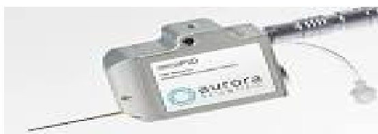
Fig. 3 Olfaction technology

for the system. The data in this technology are multivariate in nature. It is used to detect and decide complex odors using a sensor array. In order to function, the two key components are: an electronic circuit for collecting, transporting odors to sensor array and digitize sensor responses, as well as the signal processing and pattern analysis component [7]. Figure 3 shows an image picture of Olfaction technology.