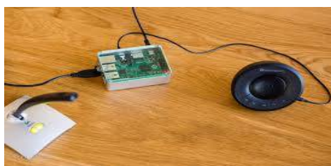
Fig. 4 Few devices used in Speech processing technology

The system consists of a microphone array equivalent to human's ears. The system can understand mainly voice commands and confine the direction of speaker. Speech recognition is realized based on pattern matching. The system could recognize speech, localize speaker and get to the position of speaker. Such a thing has potential for application in somewhere voice communication plays a crucial role [8]. The framework of speech recognition refers to system where a person can speak via a microphone to a computer. The words which are spoken are translated by the system into text or command. Then this translated version of command or text is executed as a function in computer. The intelligent speech recognition enables the system to understand spoken instructions. Figure 4 shows a picture of few devices used in speech processing technology.