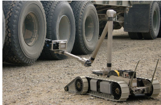
Fig.2 LWIR Automated Scanner.