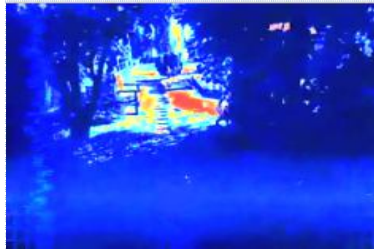
Fig.3 Infra red Video Frame.

Pre-screener hits in UTM space are back-projected into the video at multiple standoff distances and cell-structured local binary patterns (LBPs), histogram of gradients (HOGs) and mean-variance descriptors are extracted.