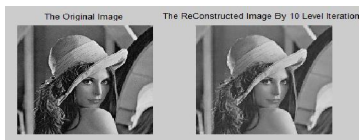
Figure2. Original And Reconstructed image without threshold value

The table I has shown below which gives the results of previous scheme and proposed scheme of Fractal Wavelet Compression technique. Both of this schemes of fractal wavelet Compression Technique is tested for 512 x 512 original image of lenna. The Results of performance is shown in table I given below. In this paper we shown that by choosing the threshold value we can reduce the redundancy among domain and range blocks before matching, because there are lots of similar blocks in the block pools. By setting the threshold value maximum number of domain blocks will be eliminated, and few domain blocks will be left. Due to this very small time will be consumed. And finally we obtain the result with very less encoding and decoding time in few seconds and with high compression ratios moreover with good quality of image.