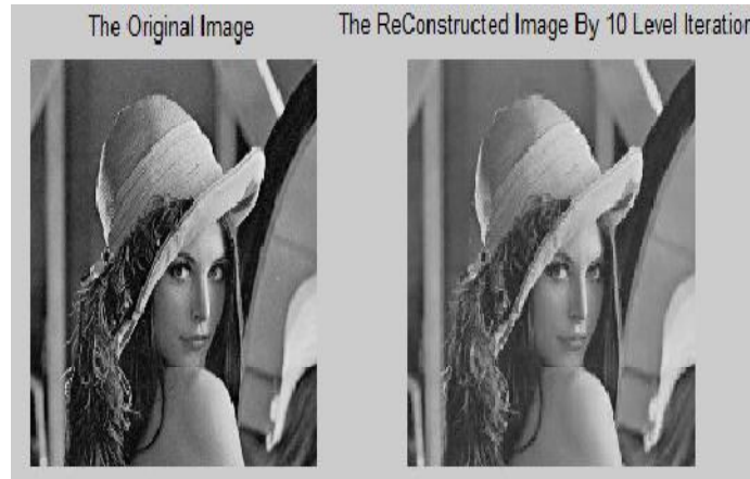
Figure4. Original And Reconstructed image