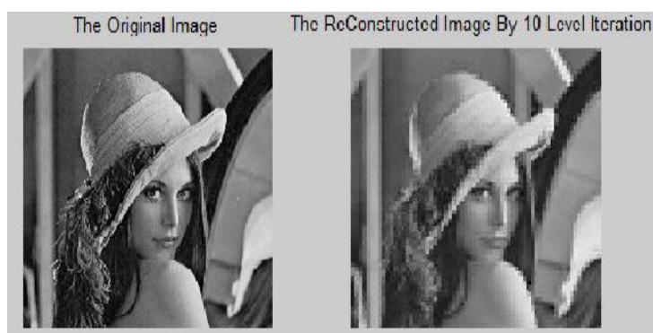
Figure3. Original And Reconstructed image