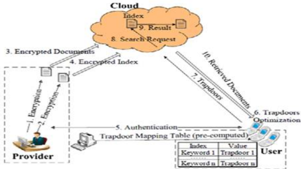
Figure 2: System architecture

The trapdoor generation process and the cloud search algorithm are retrofitted to reduce search delay and network traffic. For trapdoor generation, EnDAS stores a precomputed Trapdoor Mapping Table (TMT) in mobile devices, which maps common English words to corresponding trapdoors. When the mobile device initiates a search request, the trapdoor is looked up from the table instead of being requested from the provider. This optimization saves one network round trip for the trapdoor generation. Furthermore, EnDAS also provides new algorithms to optimize and compress trapdoors to reduce network traffic to transmit trapdoors. For the search algorithm, EnDAS proposes to leverage a binary tree structure to reduce the lookup costs and thus improve the search responsiveness. Figure shows the search flow in EnDAS system.