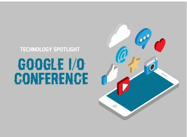
FIG 2. GOOGLE UPDATES

Google called its latest operating system a "vision of AI at the core of the operating system." Here's a few of the new features it previewed for the OS, which will likely launch later in the year.