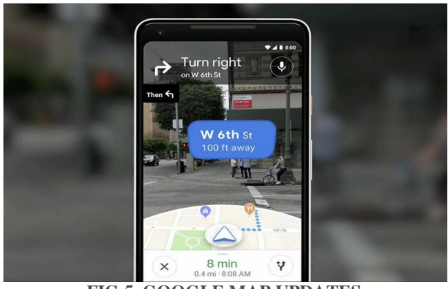
FIG 5. GOOGLE MAP UPDATES

Using your phone's camera, you'll soon be able to open up Maps, and have the app point you in the right direction as you navigate to your destination. There will be arrows floating above you, pointing you in the right direction. Google said it's also toying with having a cartoon fox show you the way to go. Opening the camera in Maps will also give