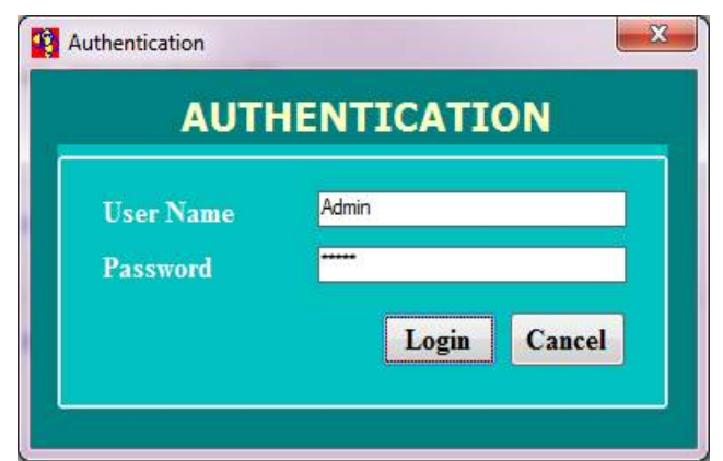
Fig.2 Authentication Window

The following figure illustrates the authentication window of the proposed system.