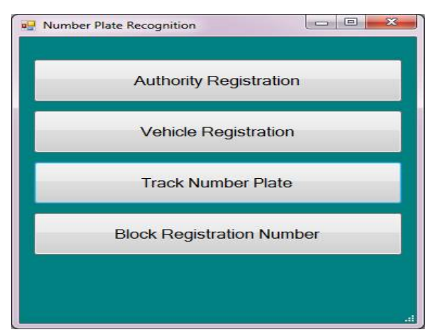
Fig.3 Main Page