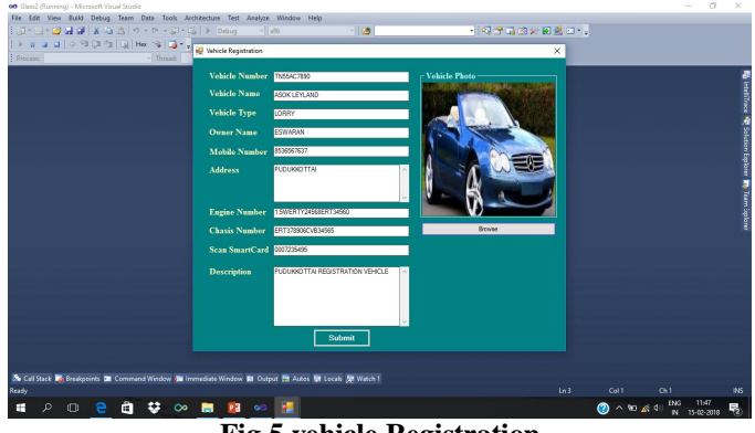
Fig.5 vehicle Registration