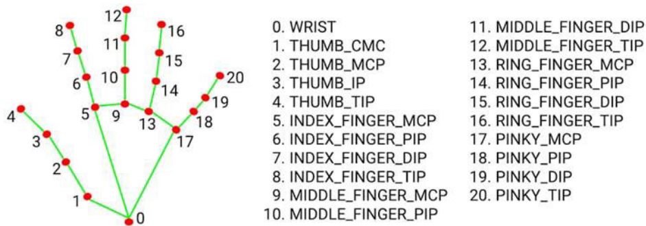
Fig 1.1 MediaPipe Structure for Hand Recognition

Step5: For the mouse to perform Left Button Click