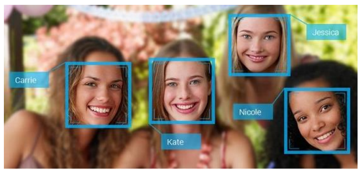
Figure.4 Face Recognition of Multiple Faces in an Image

This snapshot shows the driver wearing glasses. We can see that the framework distinguishes both face and eye region and gives ready when the eyes are shut for over 4 seconds.