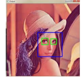
Figure.2 Face and Eye Detection

Feature extraction methods can be characterized as Contour-based and region-based approaches in two classes. Just from the limit and region based approach extricates feature from the whole region can the form based procedure measure the shape feature. Two methods of approach are associated with these methodologies. First is a continuous procedure that doesn't break structure into subparts. To determine the capability vector, it utilizes the necessary limit. Second, the Discrete (Global) Approach separates the limit of the structure into subparts and computes the vector of the multi-layered capability. Computing region, circularity, unconventionality, significant hub direction, and bowing energy are remembered for the Shape descriptor. Famous limit decay techniques are based on polygonal estimation, disintegration of arches and bend fitting utilized in image handling.