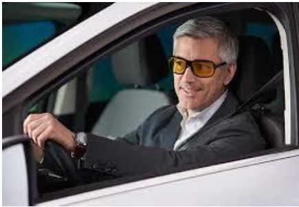
Figure.3 Driver Wearing Glass

The spatial surface is F easy to utilize and data can be removed from any shape. These features are entirely defenseless to contortions and clamor. The phantom surface is great and requires less estimation. Square region with adequate size is required for powerful feature ghastly surface. To extricate the surface capability for image grouping, the Gabor channel is usually utilized. By acquiring the middle recurrence and direction boundary, the Gabor channel or wavelets portray an image. By catching the energy at a particular recurrence and bearing, a capability vector is produced.