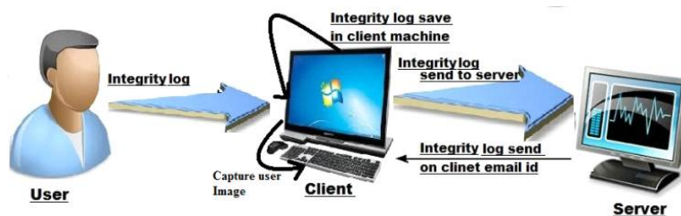
Figure 3. File Integrity

In proposed system we are detecting the intrusion through many thing like integrity, checking currently running processes, by key log, etc. These all activities are performed by user. The first activity is file integrity. We are detecting intrusion through file integrity. In file integrity concept if any user delete the file or modify file or insert file into specific directory then by using our system we can detect it. If any file delete or modify of insert into specific folder then that file will save in folder which is specified by client. Then file integrity log send to server. Server send the integrity of that file to the clients email id. So that client will easily know which file is modified. So that that we can recover that modified file from specified backup folder.