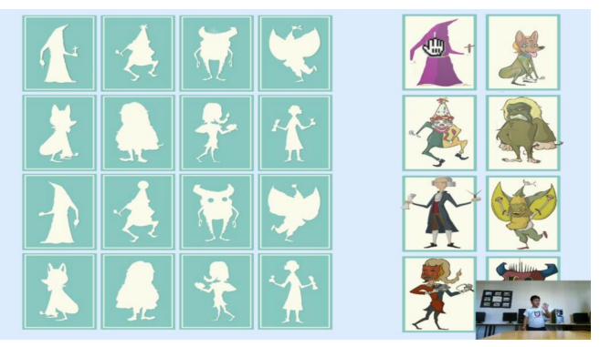
Figure 2. Screenshot of Shapes scenario in ATHYNOS.