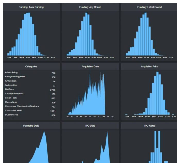
Fig.3.Shows statistics of companies.