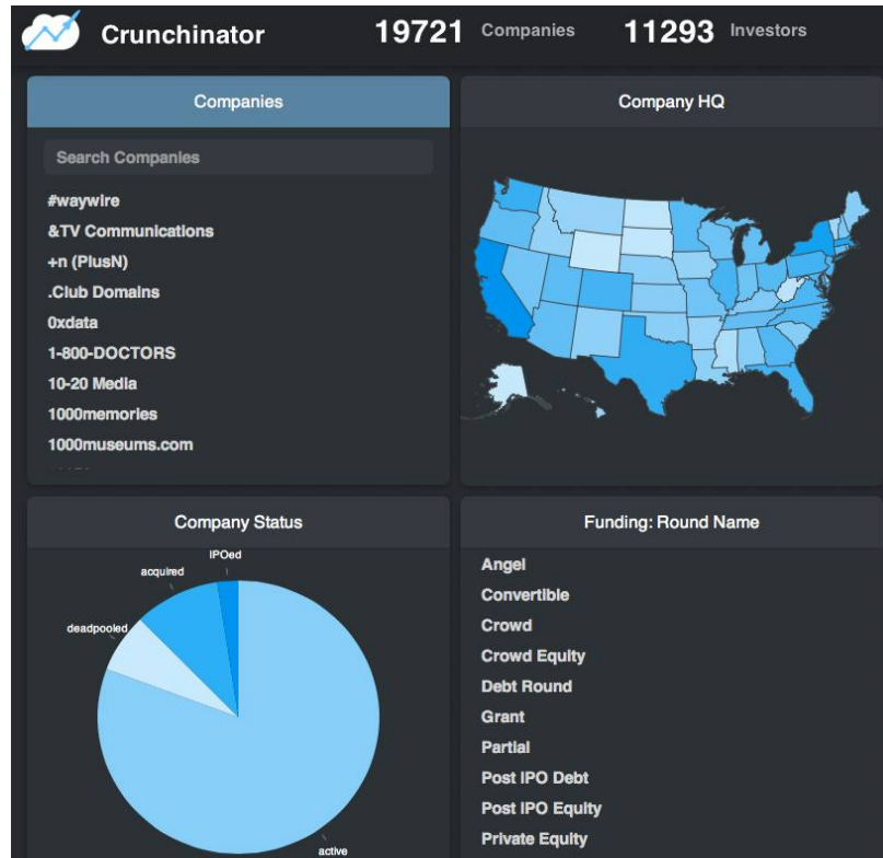
Fig.2.List of companies and a map to select a country, this will allow user to select from list of companies and then dynamically give the detailed statistics in the form of graphs and charts.