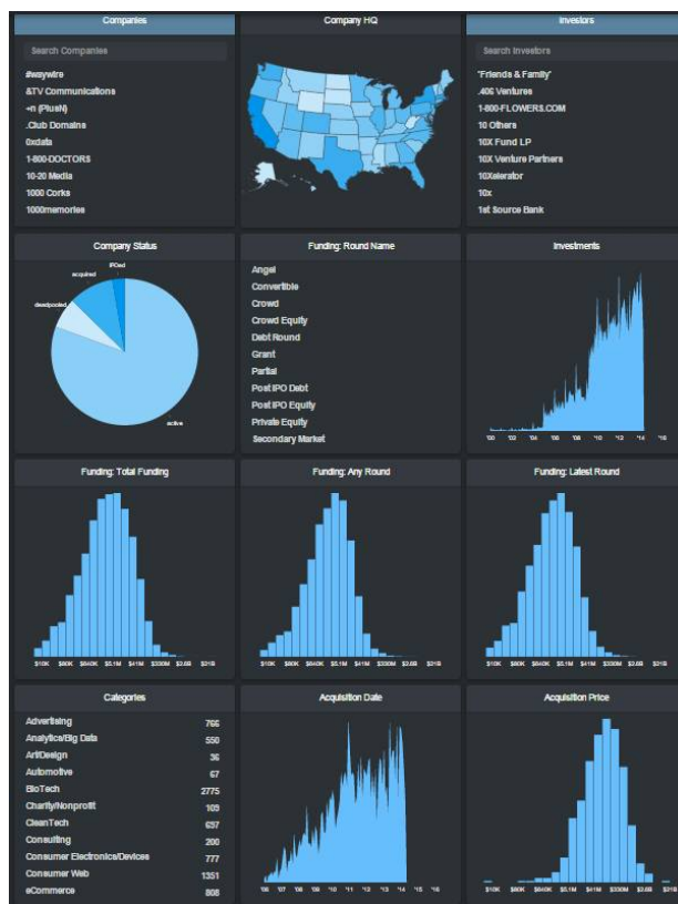
Fig.4. Financial analysis with graphical representation, the entire GUI will look like this on a web browser and by the magic of single page application there will be no page reloads. The will keep on updating dynamically as per user selections.