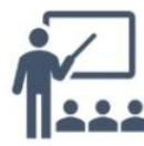
Teaching Face to Face