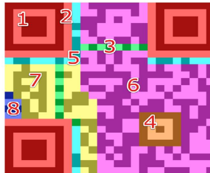
Fig-3 : Structure of QR Code

The symbol of QR Code can be classified into a number of parts as follows: