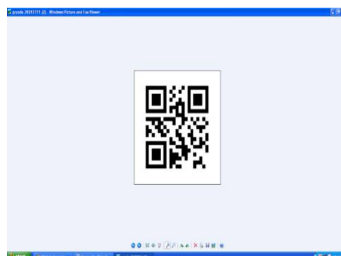
Fig-2 : Example of QR Code