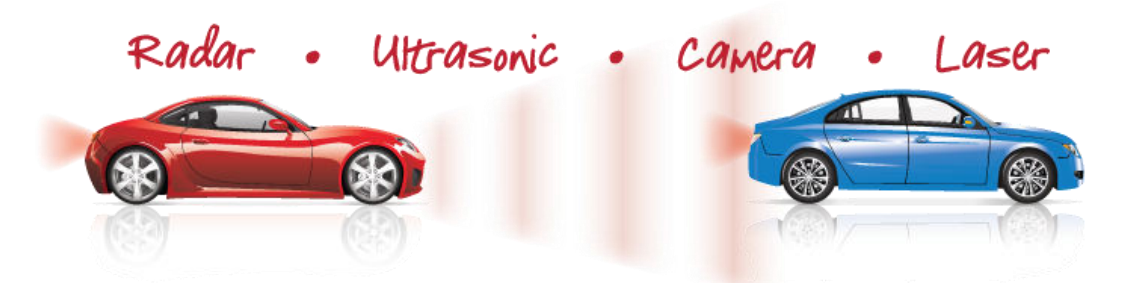
Fig. 1: Different sensors read the road ahead of you for traffic.

Accelerate to your set speed, then turn on the ACC. Tell the ACC how close you want your following distance gap to be (generally short, medium and long distances), and it's then set to begin working (Fig.2)