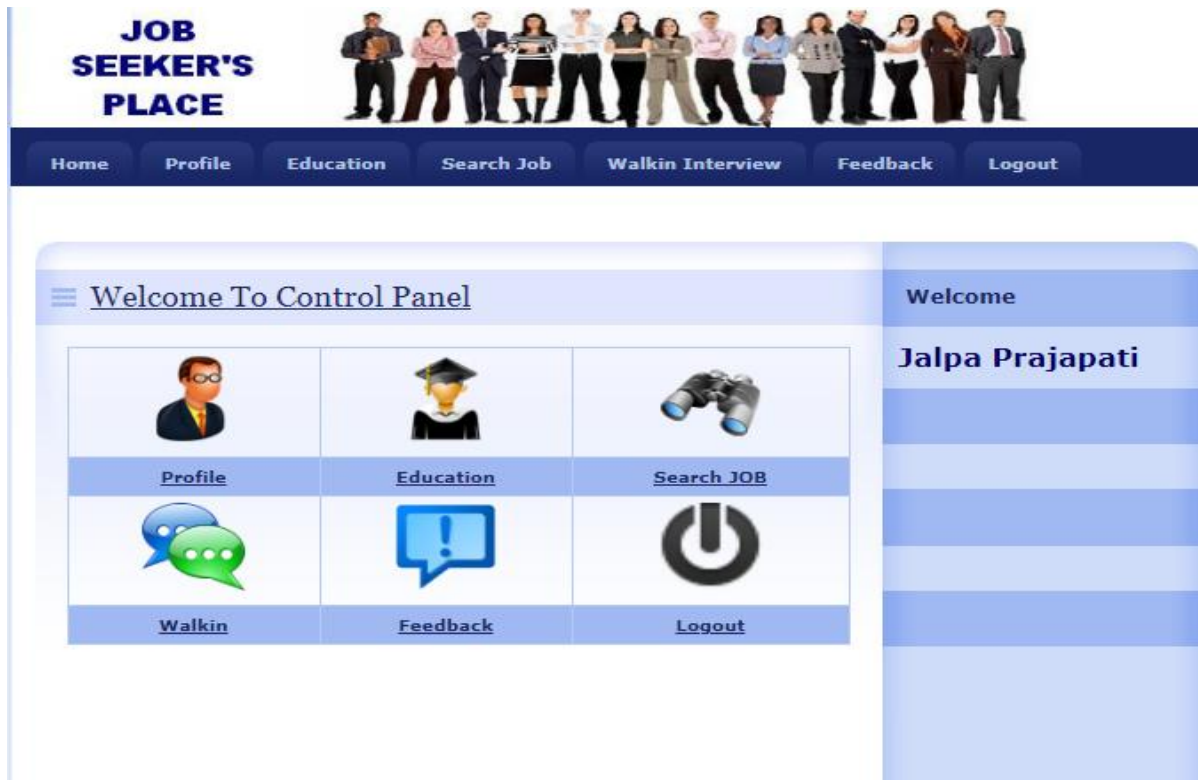
Figure 4: Job Seeker Login