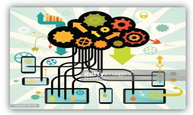
Figure1: Mobile cloud computing

The concept of offloading has been studies for a long time under the name of cyber for aging or computation offloading