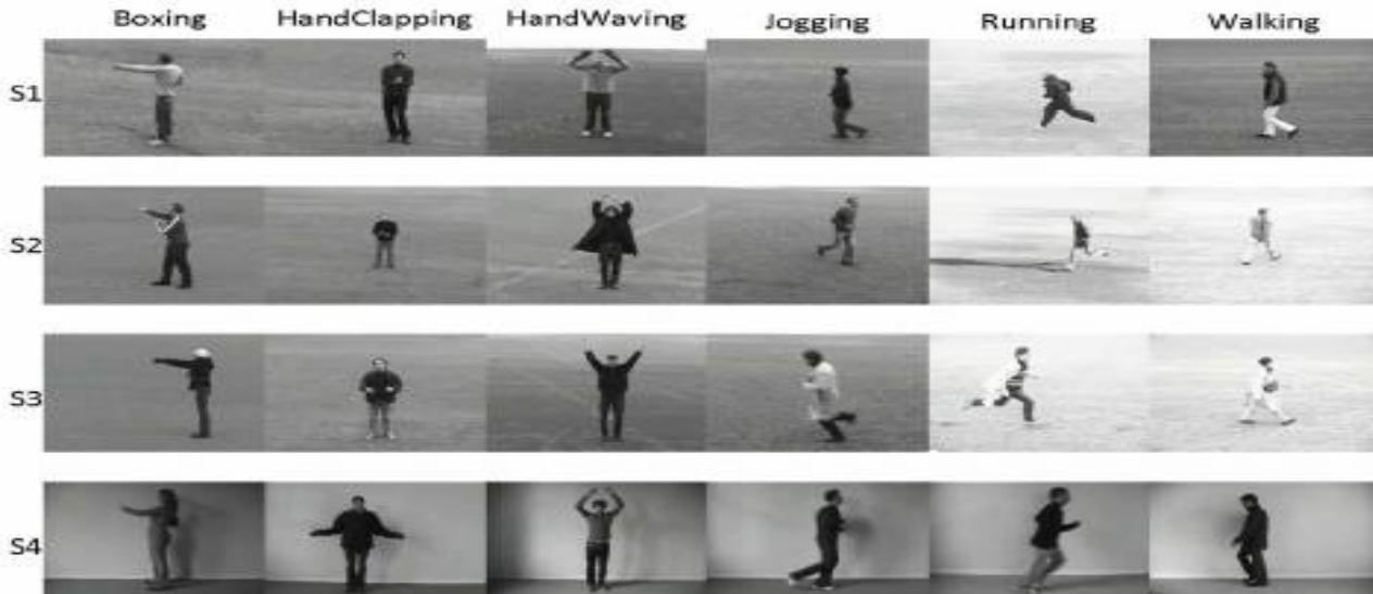
Fig. 1. KTH dataset with six actions with 4 scenarios [6]

The paper compares the efficiency of HOG and 3D SIFT feature descriptors used with SVM and KNN classifiers for human action recognition from videos. Thus, there are four combinations compared for human action recognition efficiency that is HOG and SVM, HOG and KNN, 3D SIFT and SVM and 3D SIFT and KNN.