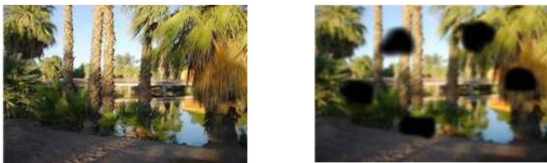
Fig.1. (a) non diabetic retinopathy Vision (b) With Retinopathy vision

Diabetic Retinopathy: Diabetic retinopathy is the prime cause of vision loss amongst the working age population of the developing and the developed countries. Diabetic patients are 25 times more probable to become blind than non-diabetic patients [1]. Diabetic retinopathy is a complication of diabetes to the retina. Both the forms of diabetes i.e. diabetes mellitus and diabetes insipidous, leads to diabetic retinopathy eventually after some time. It is a very asymptomatic disease in the early stages and it could lead to permanent vision loss.