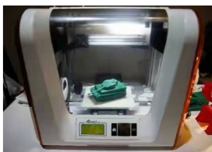
Fig12: 3D Printer