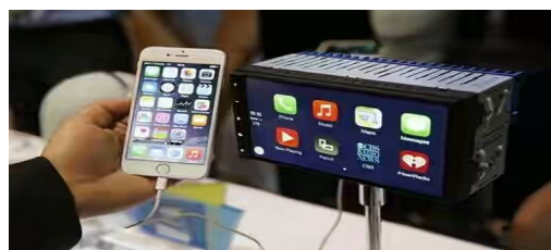
Fig5: in-vehicle infotainment system