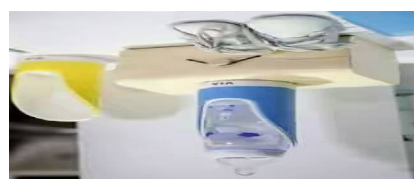
Fig8: Slow control