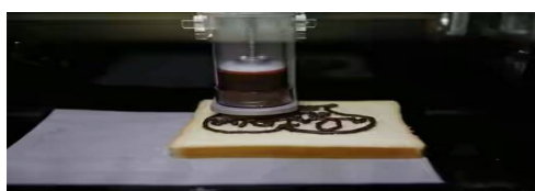
Fig11: Food Printer