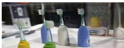
Fig9: Smart tooth brush