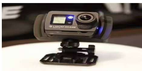
Fig13 : Wearable Camera