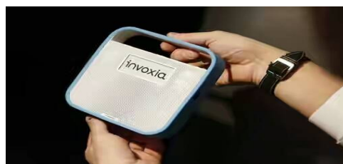
Fig 6: Smart Fridge magnet