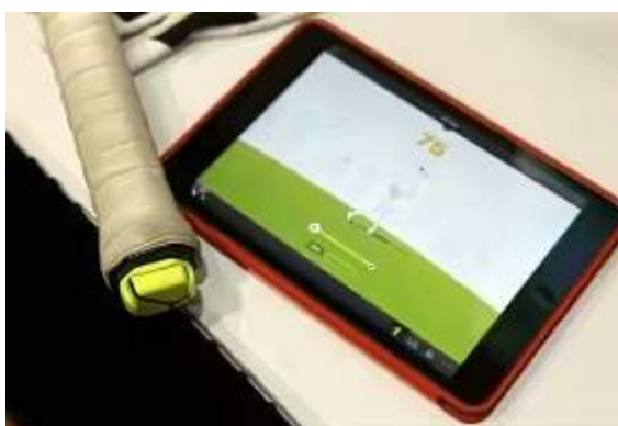
Fig3: Swing sensor