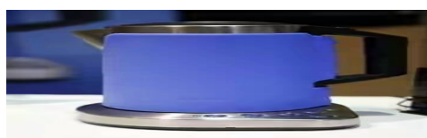
Fig7: Smart boiler