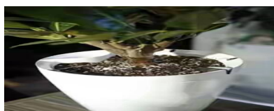
Fig10: Parrot pot