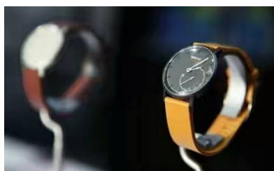
Fig14: Smart watch