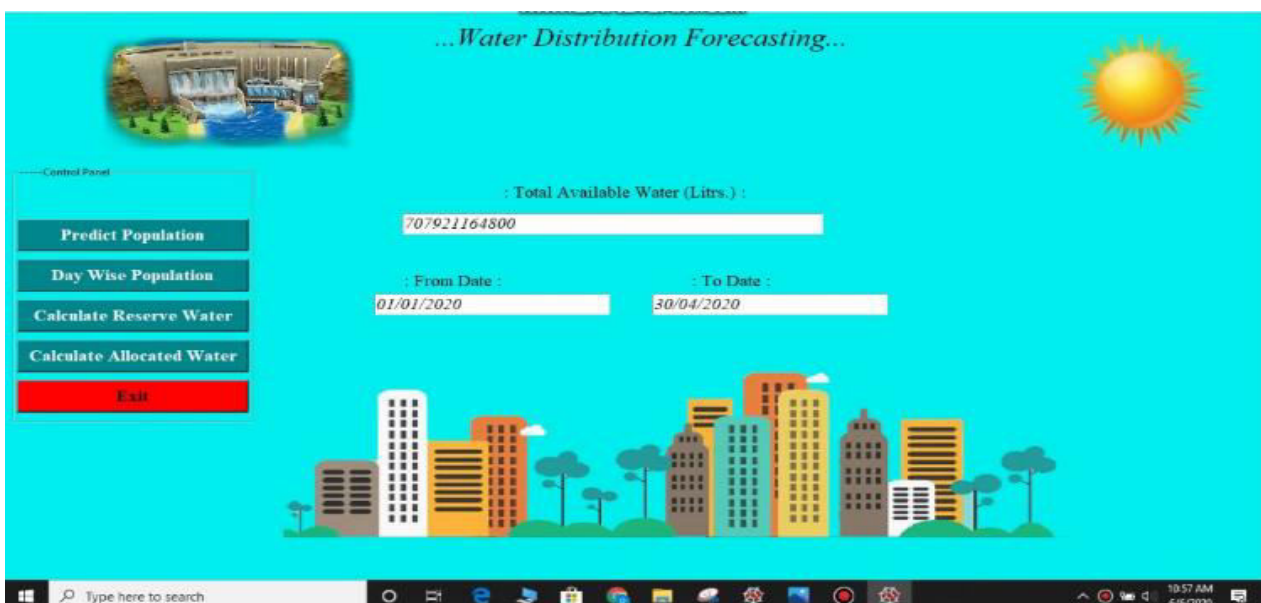
Fig. 2 Main Page