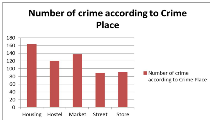
Graph 7.2: Number of crime according to crime place.

From above data, as shown 1000 total crime in particular place in graph 7.2, the numbers of place found to be Housing were 285, Hostel crime were 140, Market crime were 240, Street crime were 145 and rest store crime were 190.