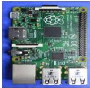
figure 2.4 Raspberry Pi

4. GSM MODULE : GSM is used to send alert message to the authorities if it crosses the threshold values. In our project we are using SIM 300 GSM module. [5]