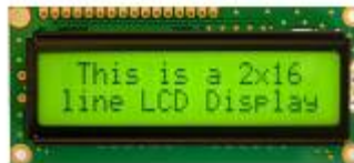
figure 2.5 16 x 2 LCD module

5. LCD : Liquid crystal display is a type of display used in digital watches and many portable computers. LCD shown in Figure 2.5 used to display the measured data. A 16 x 2 Alphanumeric Display which means on this display we can display two lines with a maximum of 16 characters in one line. [2]