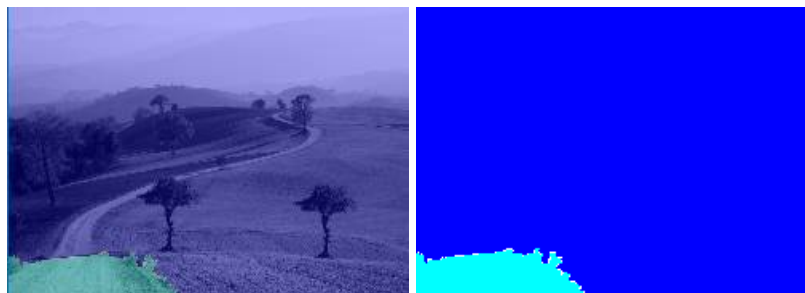
(a) Gradient of the tampered image

Fig.1 (a) shows a tampered image in which a tree is copied and placed in another location inside the image and (b) shows an original image on which forgery has to be detected.