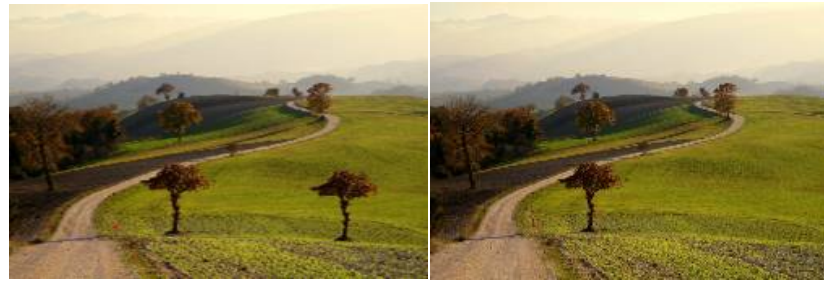
(a) Tampered Image (b) Original Image

In Fig.3 (a), the tampered image segmented by using watershed algorithm and Fig.3 (b) shows the original image segmented by watershed algorithm.