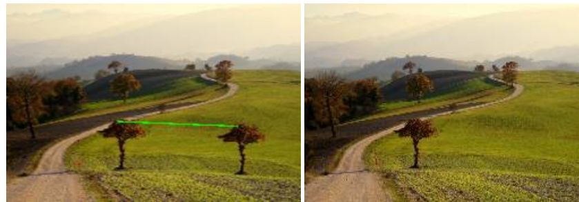
(a) Tampered Image (b) Original Image

Fig.4 (a) shows the tampered image and Fig.4 (b) shows the original images on which existing SI-CMFD algorithm is applied to detect forgery.