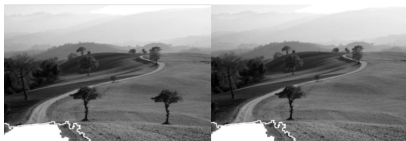
(a) Tampered image (b) Original Image

Fig.2 (a) shows the gradient calculated on tampered image and Fig.2 (b) shows the gradient calculated on an original image.