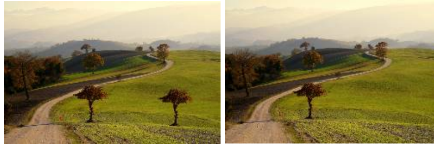
(a) Tampered Image (b) Original Image