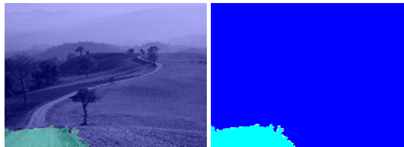
(b) Gradient of the Original image