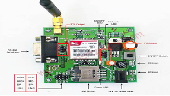
Fig 3: GSM modem

900MHz, 1800MHz and 1900MHz frequency bands. GSM system was developed as a digital system using time division multiple access (TDMA) technique for communication purpose. A GSM digitizes and reduces the data, and sends it down via a channel with two different streams of client data, each in its own particular time slot. The digital system has a potential to carry 64 kbps to 120 Mbps of data rates. A GSM modem requires a SIM card to be operated and it operates over a network range subscribed by the network operator. It just like a cellular phone. It is like our mobile phone without display [13].