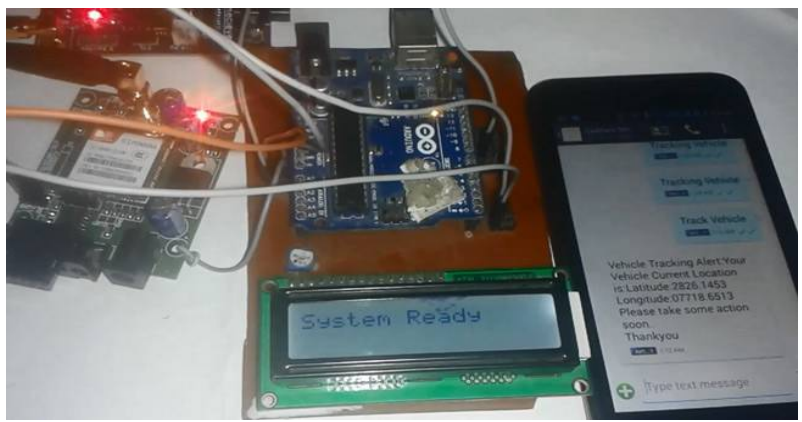
Fig7: Bus tracking kit

Successfully completed system of bus tracking system locking it remotely using GPS and GSM technologies. The developed kit of our system will be as in the following figure: