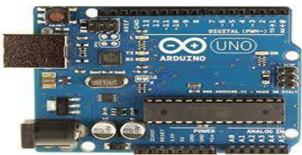
Fig 4: Arduino Uno

The Arduino Atmega328 as shown in Figure3.6 is a microcontroller board based on the Arduino Uno R3[11].It has 14 digital input/output pins(of which 6 can be used as PWM outputs), 6 analog inputs, a power jack , a 16 MHz quartz crystal, a USB socket, an ICSP header and a reset button. It possess everything needed to support the microcontroller, just it has to be connected to a computer with a USB cable or it can be powered with an AC-to-DC adapter or battery to get started. The reasons of using the Arduino board which comes with ATmega328 is for easy interfacing with the GPS and GSM module and for easy programming (in embedded C) of the microcontroller. The Arduino boards come with a library for interfacing with module and for dealing with analog or digital inputs.