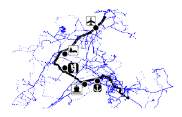
Fig1. Trajectory Search by Location