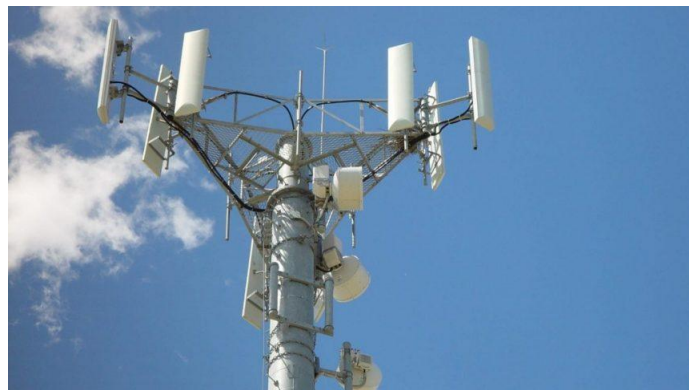
Figure 1: Antenna Array under LTE Network

In numerous remote correspondence frameworks it is important to structure antennas with order qualities (high gains) to fulfill the needs of long separation correspondence that may not be attainable by a solitary component antenna. The radiation from the single component is frequently wide in design with huge shaft edges. This isn't useful for point to point interchanges, which requires antennas that are increasingly mandate in nature for example Radar applications. Likewise, a solitary emanating component regularly creates radiation designs with unsuitable bandwidth, effectiveness, and gain parameters. All these and more make the use of a solitary component antenna not recommendable. In this manner, the execution of antennas in array design defeats these downsides.