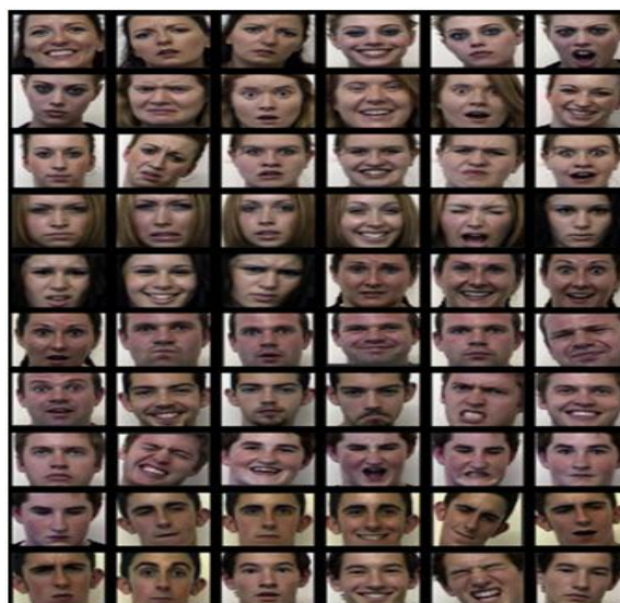
Fig. 3 Face detection

Implementation of a system that used such features would provide a feature set that was far too large, hence the feature set must be only restricted to a small number of critical features which is achieved by boosting algorithm[5][6]. The original LDA operator labels the pixels of an image by thresholding the 3-by-3 neighborhood of each pixel with the center pixel value and considering the result as a binary number. Each face image can be considered as a composition of micro-patterns which can be effectively detected by the LDA operator. To consider the shape information of faces, they divided face images into N small non-overlapping regions[8][9].