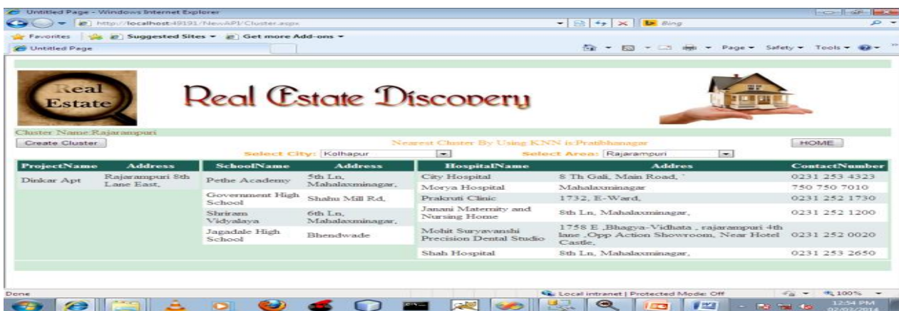
Fig.3: Cluster "Rajarampuri"

Create clusters by area wise in each city. Every area has assigned weight. Weight is increased by 1 as per consecutive areas in the particular city. Nearer areas having minimum weight difference calculated using Euclidean Distance.