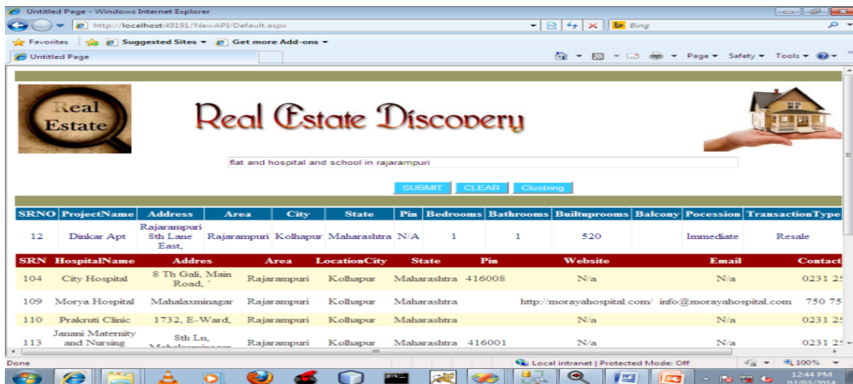
Fig.2 Process Query for Equivalence Processing