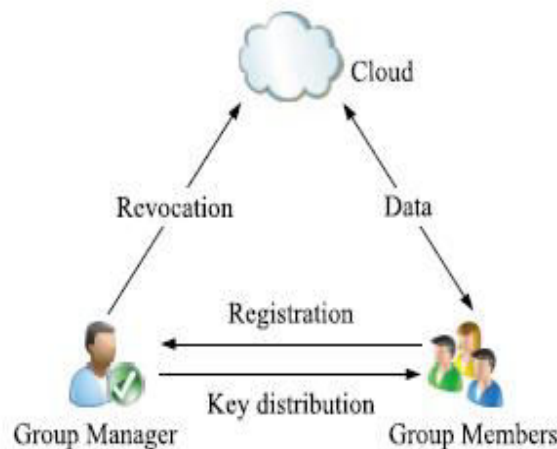
Fig. 1. System model.

Cloud is operated by CSPs and provides priced abundant storage services. However, the cloud is not fully trusted by users since the CSPs are very likely to be outside of the cloud users' trusted domain. Similar to [3], [7], we assume that the cloud server is honest but curious. That is, the cloud server will not maliciously delete or modify user data due to the protection of data auditing schemes [17], [18], but will try to learn the content of the stored data and the identities of cloud users.