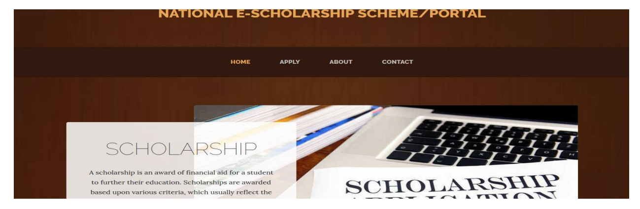
Fig.1: Home page

This document is a template for national e-scholarship scheme/portal. It is simply refers about the scholarship and fund allocation of government. By feeding the user details (like occupation, Caste, Income...) the relevant Scholarships and schemes will be displayed.[9] The displayed scholarships and scheme is suited to apply. [10]The scholarships and schemes differ based on the user details. So that each and every people not miss a chance to apply the scholarships and schemes. National Scholarships Portal is one-stop solution through which various services starting from student application, application receipt, processing, sanction and disbursal of various scholarships to Students are enabled.