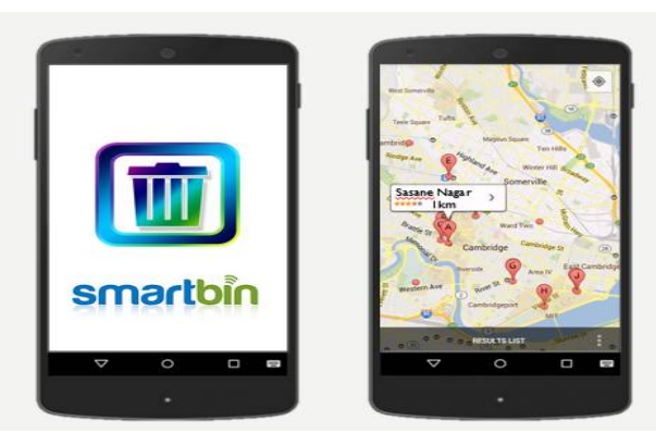
Figure 3.Smart Bin Android Application

For getting location of smart bin we use GPRS module. Using this we can get tower information and triangulate the latitude and longitude to get actual geographical co-ordinates.