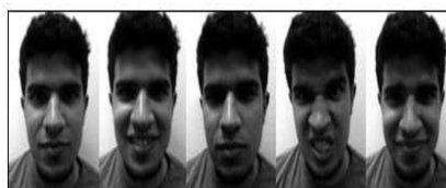
Fig 1 : Face image of a single subject with 5 different facial Images

Imaging changes: lighting variation; camera variations; channel characteristics (especially in broadcast, or compressed images).