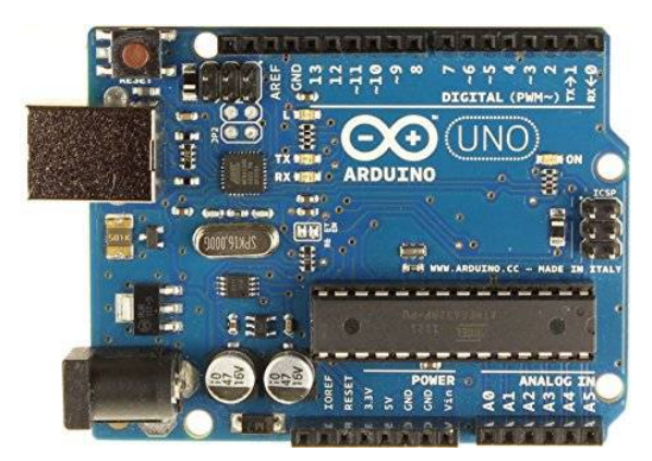
Fig.2. Arduino Uno R3 Microcontroller

Arduino Uno: It is a microcontroller board based on the ATmega328. It has 14 digital input/output pins (of which 6 can be used as PWM outputs), 6 analog inputs, a 16 MHz crystal oscillator, a USB connection, a power jack, an ICSP header, and a reset button. Arduino is an open-source physical computing platform based on a simple i/o board and a development environment that implements the Processing/Wiring language. Arduino can be used to develop standalone interactive objects or can be connected to software on your computer.