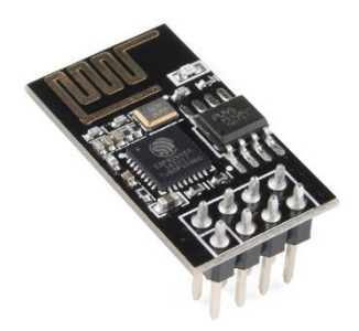
Fig.5. ESP8266 Wi-Fi module

ESP8266 Wi-Fi Module: The ESP8266 Wi-Fi Module is a self-contained SOC with integrated TCP/IP protocol stack that can give any microcontroller access to your Wi-Fi network. The ESP8266 is capable of either hosting an application or offloading all Wi-Fi networking functions from another application processor.