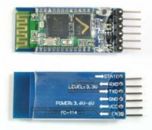
Fig.4.HC-05 Bluetooth Module

HC-05 Bluetooth Module: HC-05 module is an easy to use Bluetooth SPP (Serial Port Protocol) module, designed for transparent wireless serial connection setup. The HC-05 Bluetooth Module can be used in a Master or Slave configuration, making it a great solution for wireless communication. This serial port Bluetooth module is fully qualified Bluetooth V2.0+EDR (Enhanced Data Rate) 3Mbps Modulation with complete 2.4GHz radio transceiver and baseband.