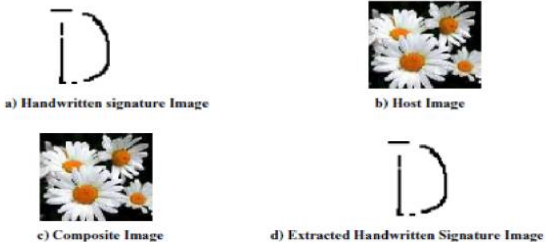
Figure - 3 Tested on Sample 2

The detailed experiment has been performed and it is found that the proposed framework is able to form watermark dynamically from the host image. In such a manner the ownership authentication is guaranteed in an efficient way. This framework is also able to embed the formed bicolor watermark into color host images and perceptually the watermark remains invisible in the watermarked image. At the time of extraction neither the host image nor the watermark image is needed. Thus it guarantees blind extraction method. Extracted image at the target shows excellent visual quality as well as it ensures that the extracted watermark remains intact. Here private / public key is used for very special purpose, which is explained mathematically in the result part and excellent PSNR values are achieved.