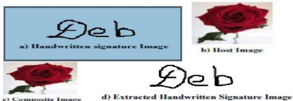
Figure - 2 Tested on Sample 1

The coded value is 121: 121 * 71 \text{ mod } 110 = 11 = 100100 .