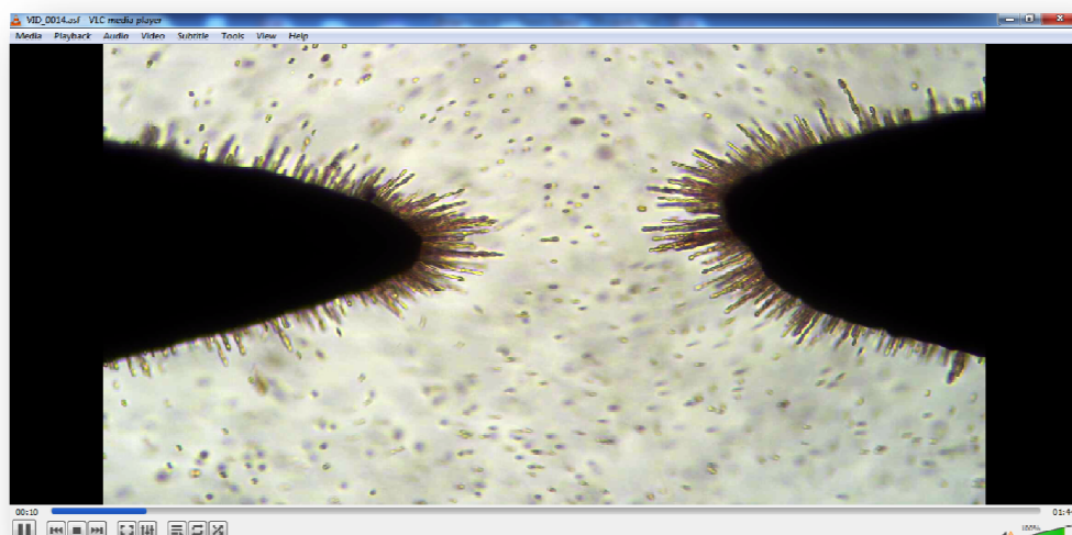
Fig.3. Video file of DEP phenomenon of human RBC captured through CCTV.

Fig.2. shows the Microscopic setup at test lab. This high-end microscope has the electrode chamber mounted on it and also connected to the CCTV which is again connected to the computer. The video and image capturing mode is set on at the computer before the application of NUEF. The live view of the activity helps in identifying any distortions or impurity in the sample and can be paused and set again with fresh sample and reconfigurations of the setup.