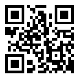
Fig: QR Code image

QR code (abbreviated from Quick Response Code) is the trademark for a type of matrix barcode (or twodimensional barcode) first designed for the automotive industry in Japan. A barcode is a machine-readable optical label that contains information about the item to which it is attached. A QR code uses four standardized encoding modes (numeric, alphanumeric, byte/binary, and kanji) to efficiently store data; A QR code consists of black modules (square dots) arranged in a square grid on a white background, which can be read by an imaging device (such as a camera, scanner, etc.) and processed using Reed–Solomon error correction until the image can be appropriately interpreted. The required data are then extracted from patterns that are present in both horizontal and vertical components of the image.