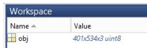
Figure 3; obj variable in workspace