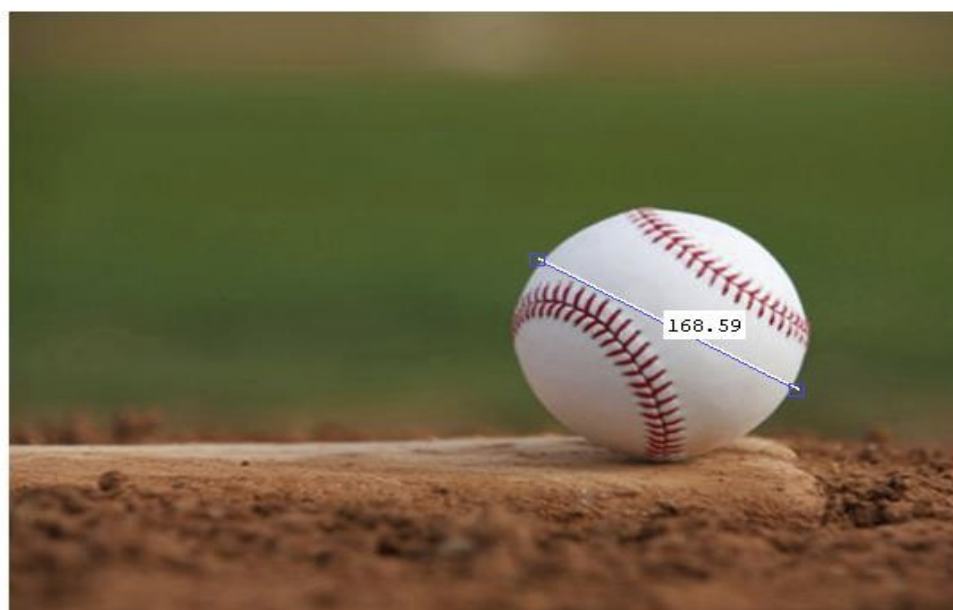
Figure 9; Original Image Manually Measure

The diameter is now displayed in the Command Window to be approx. 170 pixels across. This was verified in Figure 9 by using the imdistline function in line 50 (Figure 8). As you can see between the two figures, the value calculated by the code was very close to the manual measurement in Figure 9.