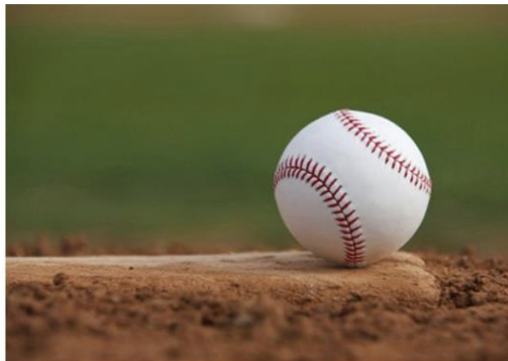
Figure 1; Original Image, ball.jpg

Open the MATLAB software and in the application section; download the Image Processing Tool Box. Create a new MATLAB script file. Refer to Figure 2 to begin adding code to import the desired image to measure into the MATLAB workspace. The first few lines clear the workspace to remove any previous variables and clear the command window. It is important that the Current Folder that you are working out of be the folder that contains both the script file and image. The command imread reads an image and converts it into a “3-dimensional” matrix in the RGB color space. The image used in this tutorial is ball.jpg (Figure 1), which is a 534 by 401 pixel image. The imread function converts this into a matrix that is 401x534x3 (Rows x Columns x RGB). The final dimension (RGB) corresponds to a red, green and blue intensity level. Use imshow to view the produced image in a new window.