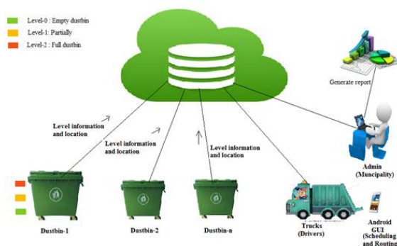
Fig 2: System Architecture

To design system for waste collector which will show the information about level of waste in waste collector to user and on android application and also show the all available waste collector in nearby area and path to nearest waste collector.