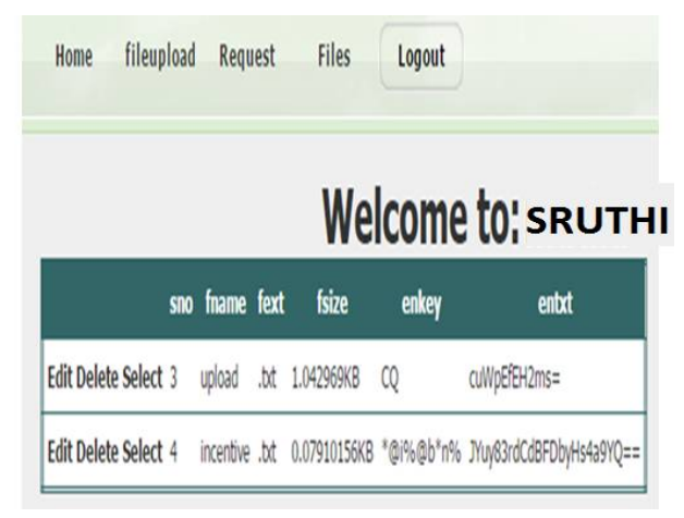
Fig.4. List of files searched

(A High Impact Factor, Monthly, Peer Reviewed Journal) Website: <u>www.ijircce.com</u> Vol. 5, Issue 10, October 2017