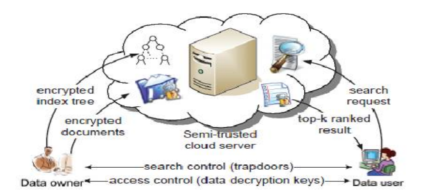
Fig.1. Proposed system model

In our scheme, the data owner firstly builds a secure searchable tree index I from document collection F, and then generates an encrypted document collection C for F. Afterwards, the data owner outsources the encrypted collection C and the secure index I to the cloud server, and securely distributes the key information of trapdoor generation and