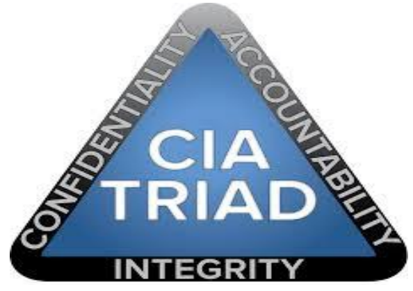
Figure.1. CIA Triad

(An ISO 3297: 2007 Certified Organization) Vol. 3, Issue 5, May 2015