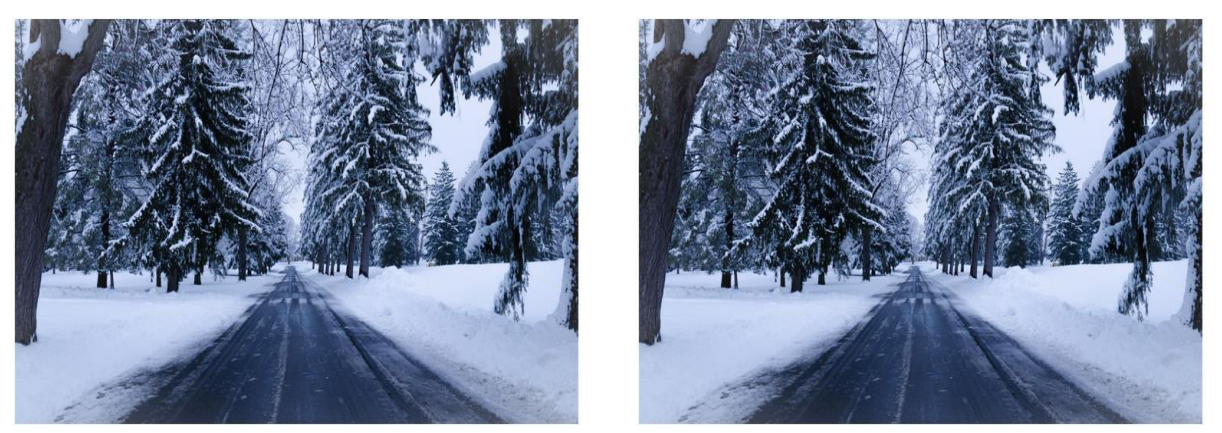
Fig 5 : Before Encoding

The above data is encoded in the cover image using LSB algorithm. The fig [5] and Fig [6] represents the image before and after encoding.