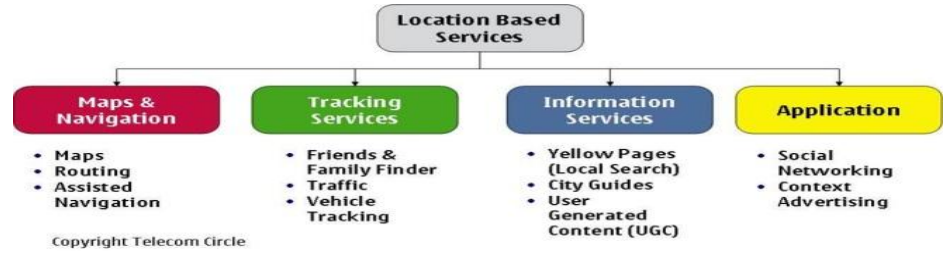
Figure 2 Location Based Systems

Location-based services (LBS) applications that provide information to users based on their location are a growing business. From social networking to navigation to banking, consumers are being offered a range of new location-based services. But every time a consumer uses one of these services, there is a risk that the company offering the service may be collecting and retaining detailed records of who she is, where she goes, and what she does. Once collected, outdated privacy laws and varying corporate practices can leave this sensitive information vulnerable to access by the government and third parties. What are the privacy implications of LBS, and how can businesses, policymakers, public interest groups, and consumers work together to update the laws and create stronger policies so that consumers can feel confident using these services?