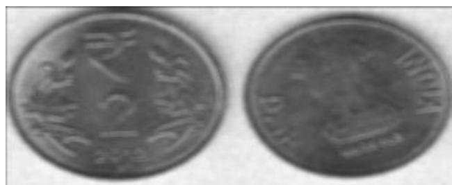
Fig 7 Mean filter used on Poisson noise