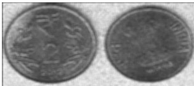
Fig 8 Mean filter used for Speckle noise