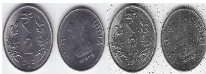
Figure 1: Original image without noise, Image with salt & pepper noise

Impulse Noise (Salt and Pepper Noise) :- The term impulse noise is also used for this type of noise [5]. Other terms are spike noise, random noise or independent noise. Black and white dots appear in the image [6] as a result of this noise and hence salt and pepper noise. This noise arises in the image because of sharp and sudden changes of image signal. Dust particles in the image acquisition source or over heated faulty components can cause this type of noise. Image is corrupted to a small extent due to noise. Show the effect of this noise on the original image (Fig 1).