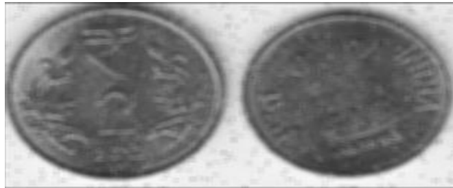
Fig 5 Mean filter used on Salt pepper noise

Mean filter is an averaging linear filter [6]. Here the filter computes the average value of the corrupted image in a predecided area. Then the center pixel intensity value is replaced by that average value. This process is repeated for all pixel values in the image. Figure 5-8, show the effect of using mean filter of size 5X5 on different types of noise.