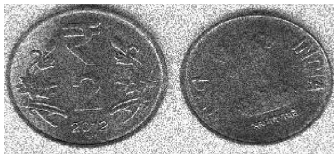
Figure 4: Image with speckle noise

This noise is originated because of coherent processing of back scattered signals from multiple distributed points. In conventional radar system this type of noise is noticed when the returned signal from the object having size less than or equal to a single image processing unit, shows sudden fluctuations.