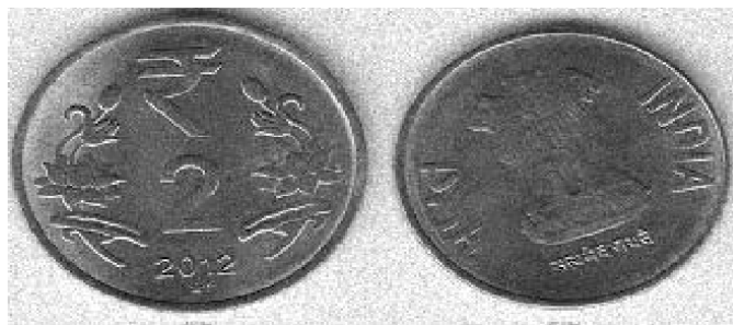
Figure 3: Image with Poisson noise