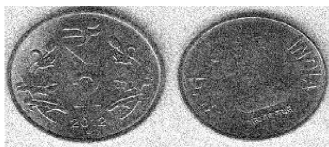
Figure 2: Gaussian noise

Gaussian Noise (Amplifier Noise):- The term normal noise model is the synonym of Gaussian noise. This noise model is additive in nature [7] and follow Gaussian distribution. Meaning that each pixel in the noisy image is the sum of the true pixel value and a random, Gaussian distributed noise value. The noise is independent of intensity of pixel value at each point.