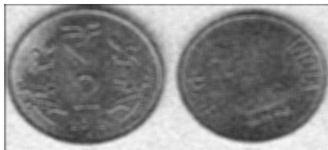
Fig 6 Mean filter used on Gaussian noise