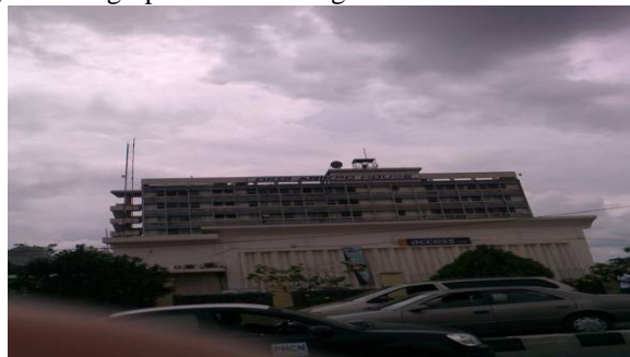
Fig.2: Measurement location with the transmission point on the roof-top of the OkoiArikpo building, Calabar.